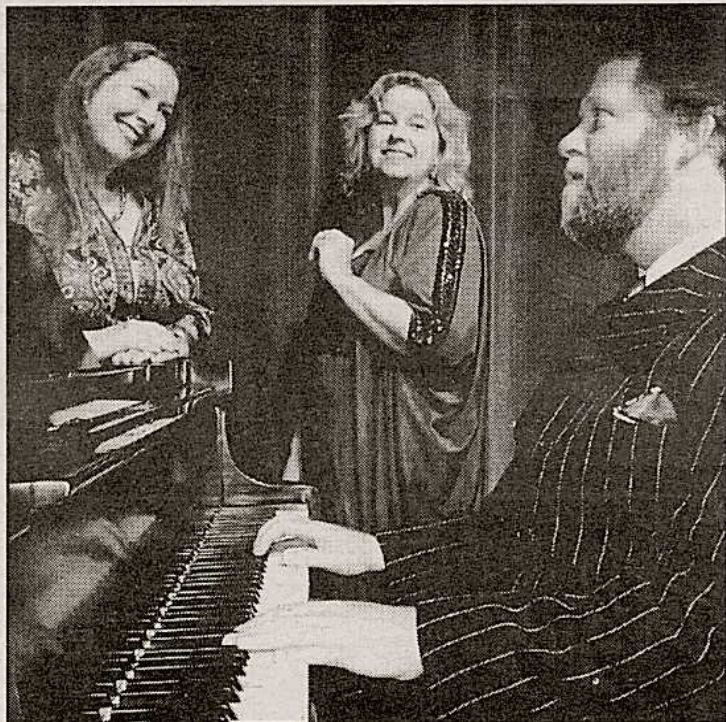
Cast members from Sunnyvale's Merrily We Roll Along rehearse for this weekend's opening.

For more information, call the box office at (408) 733-6611 or go to www.sunnyvaleplayers.org .